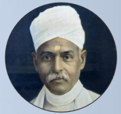
Pandit Madan Mohan Malaviya (Founder of the Society)